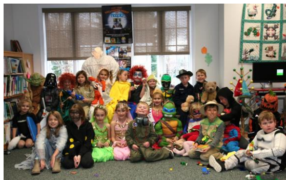
Halloween Fun at the 2016 Annual Costume Party and Contest